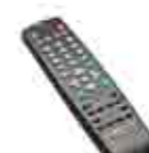
HS3 Remote Control (Batteries not included)