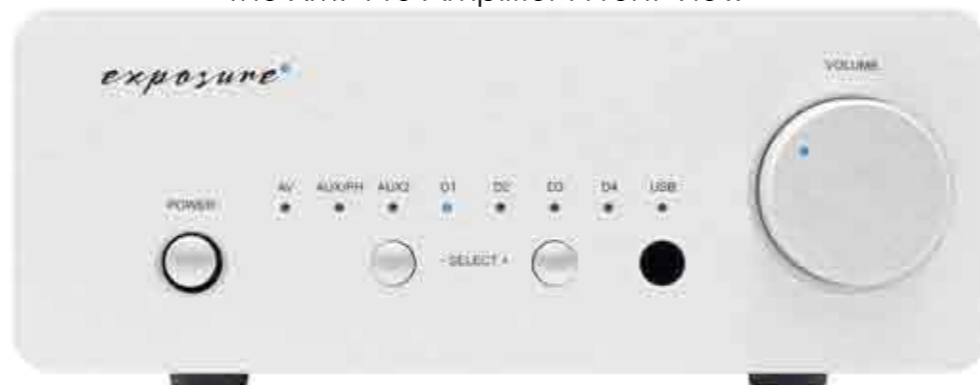
The XM7 Pre Amplifier : Front View