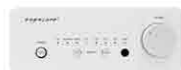
Exposure XM7 Pre Amplifier