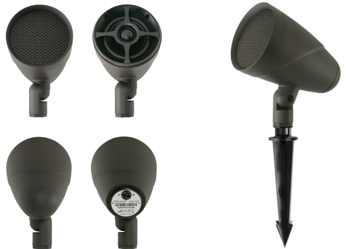
Ground stake sold separately